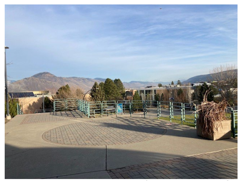
Figure 3. Perspective 2 and Location for the Design within School of Trades and Technology