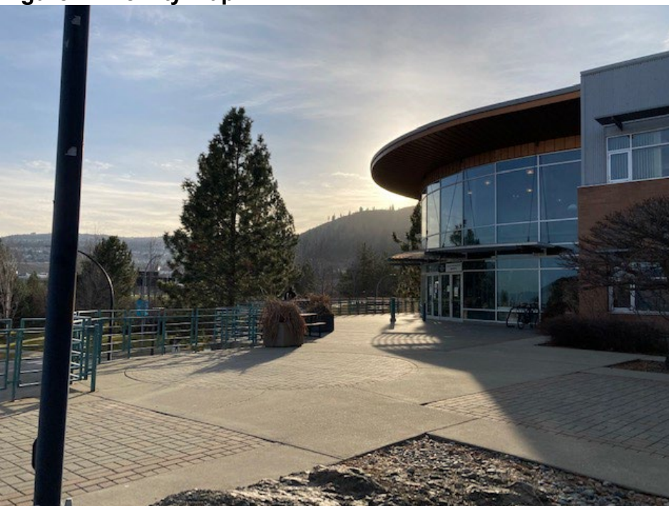
Figure 2. Perspective 1 and Location for the Design within School of Trades and Technology