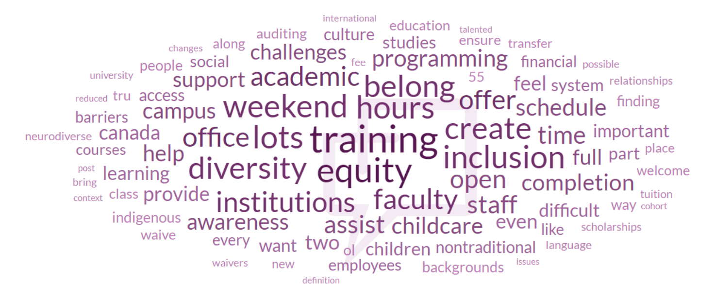
Figure 2. Word Cloud

A frequency analysis (Figure 2) of terms, within the 96 thoughts that were shared, revealed that diversity and equity were a central focus of this discussion, which was also reflected in the Top 2 Thoughts.