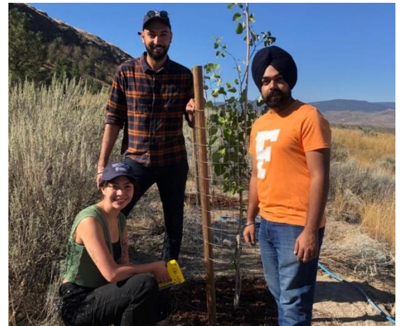
Building on from the 102 trees that were planted last year, this year mulch was added by volunteers